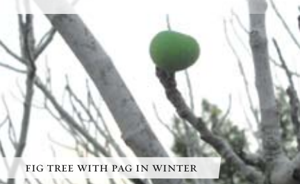
FIG TREE WITH PAG IN WINTER

And when he saw a fig tree in the way, he came to it, and found nothing on it but leaves [MARK II: for it was not the time for figs] and he said to it, "Let no fruit grow on you henceforward for ever." And presently the fig tree withered away. MATTHEW 21