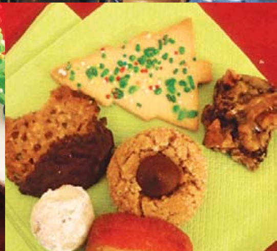
Neighbours from the village of Migdal were invited to a Christmas Open House at Beit Bracha. The Christmas Story from the book of Luke was read in both English and Hebrew, Christmas carols were sung - and there were lots of Christmas goodies! Books, Bibles and fruit from the trees at Beit Bracha were gifts to take home.