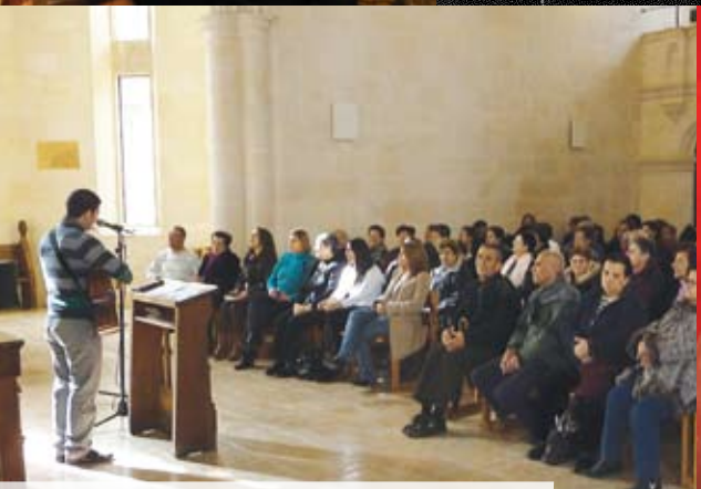
The Old City’s Christian elderly (& a few Muslims) enjoyed an afternoon Christmas party at Christ Church. Jewish believers made cakes, cookies and served coffee, and a local Arab pastor gave his testimony. And everyone was happy to receive a gift - warm socks, gloves, or a hat.